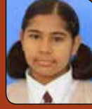
AYUSHI 7D - JUN 5