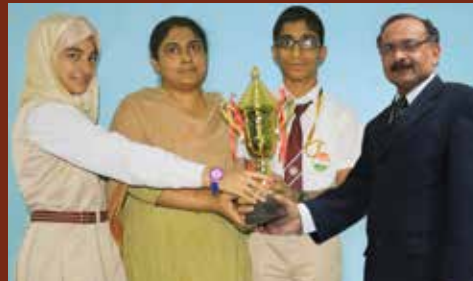
SECOND - VIII B