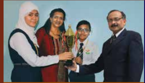
THIRD - XII B