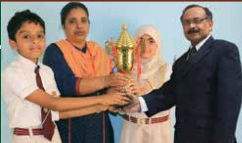
FIRST - VII A