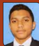
AVION ARMANDO 11B - JUN 16