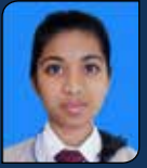
SRI LAKSHMI ANNAPURNA - 10B

Beale Ciphers – potentially the most valuable coded messages in the world. The Beale Ciphers are a series of encrypted messages which seem to indicate the location of a buried treasure but, the origin of the Beale Ciphers is shrouded in mystery.