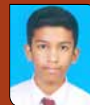
TAHA 10G - JUN 20