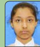
GURLEEN - 6A