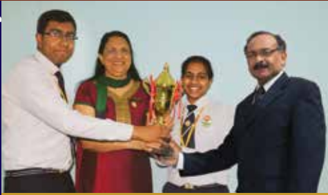
FIRST - XII A