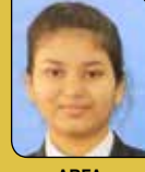
ARFA 11I - JUL 11