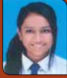
PELISHA 12A - JUN 4