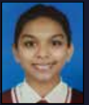
KAAVYA V. 10A