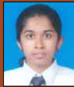
LIJAMOL V. 94.4%