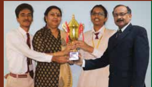
THIRD - X B