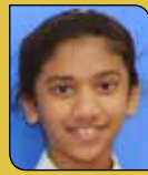
NITUNA ISHI 7A - JUL 3