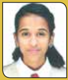
BATUL 10G - JUL 1