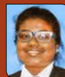
BRITAKEREN K. 11B - JUN 17