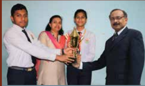
SECOND - XI B