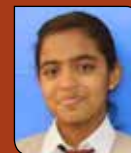
FEB ALEX 10 F - JUN 21