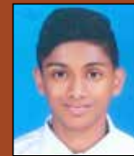
SILLA SWASTIK 93%