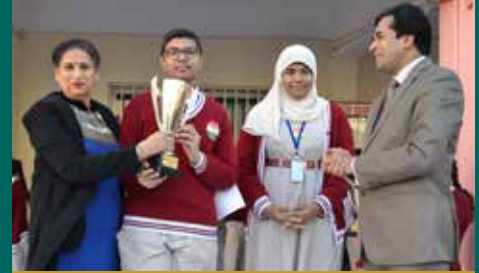
FIRST - 8C