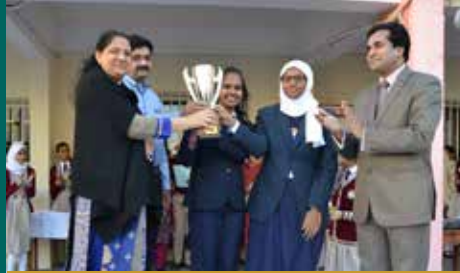
FIRST - 11A