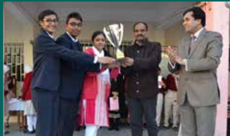
SECOND - 11E