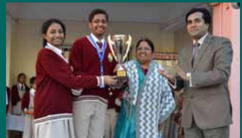
THIRD - 10A