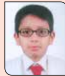
BEHLAH 10E - JAN 16