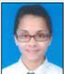
DONA AJAY - 11H