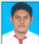
MOHAMMED ALI - 10F