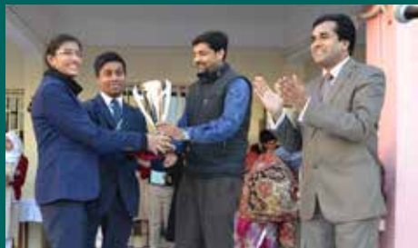
THIRD - 11B