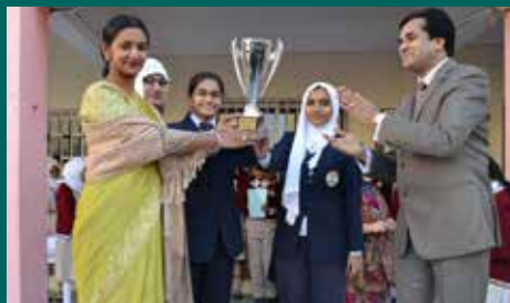
THIRD - 11G