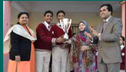
SECOND - 9B