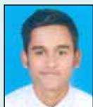
MUSTANSIR - 12K