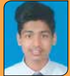
ASHMEN R - 12D