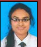
MERIL - 12 E

Fill up every movement with spice and flavour! Add a pinch of positivity and a dash of happiness and there you have it, the perfect changes one can make.