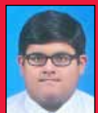
ABHIRAM V. KURUP 12A

The plane she is flying is called an Ercoupe and it is one of the few airplanes to be made and certified without pedals. Without rudder pedals Jessica is free to use her feet as hands. She took three years instead of the usual six months to complete her lightweight aircraft licence, had three flying instructors and practiced 89 hours of flying, becoming the first pilot with no arms.