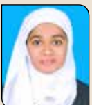
KHERODAWALA R. 12 - APR 6