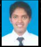
SREEJA - 12B

The roots of astrophysics can be found in the 17th century emergence of a unified physics, in which the same laws applied to the celestial and terrestrial realms. The efforts of the early, late, and present scientists continue to attract young people to study the history and science of astrophysics.