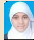
EMAN - 12I