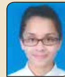
DONA AJAY - 12H