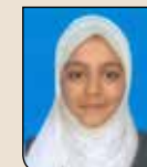
PANIWALA RUKKAIYA 12I - APR 10