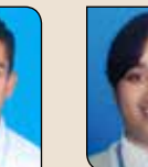
ADLENE 10E - APR 10